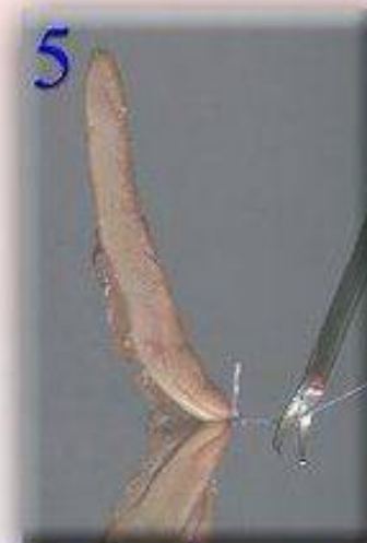
5 Ending the knot in 60 SEC.

This automatic surgical knot pusher device comprises a thick-walled cannula or tube having a bevelled tip and a central channel for slidably receiving one end of a suture and the other end of the suture is outside through port and is inserted in longitudinal grooves formed on the