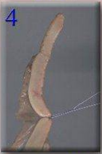
4 The second knot