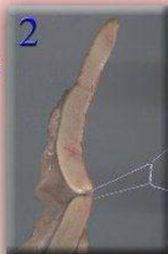
2 First Knot in 30 SEC.