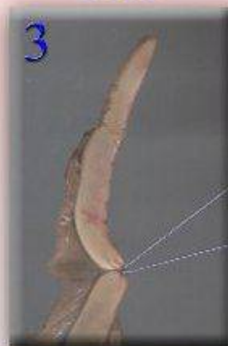
3 Tightening the knot