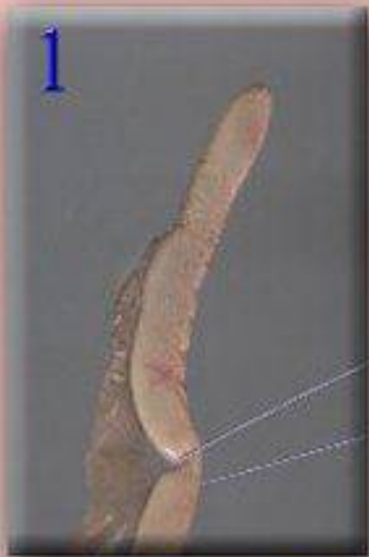
1 Suturing by built-in needle